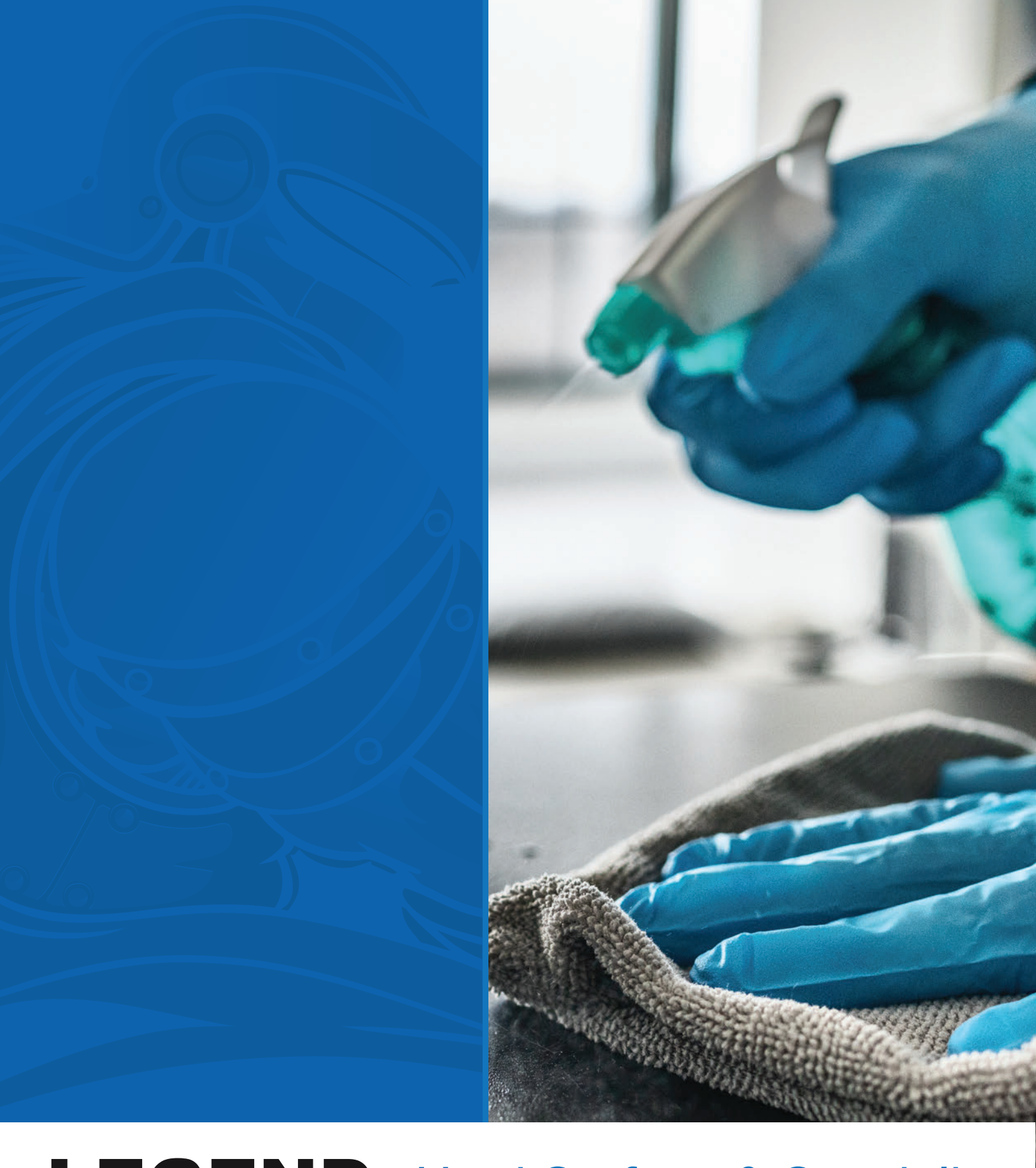
LEGEND Hard Surface & Speciality