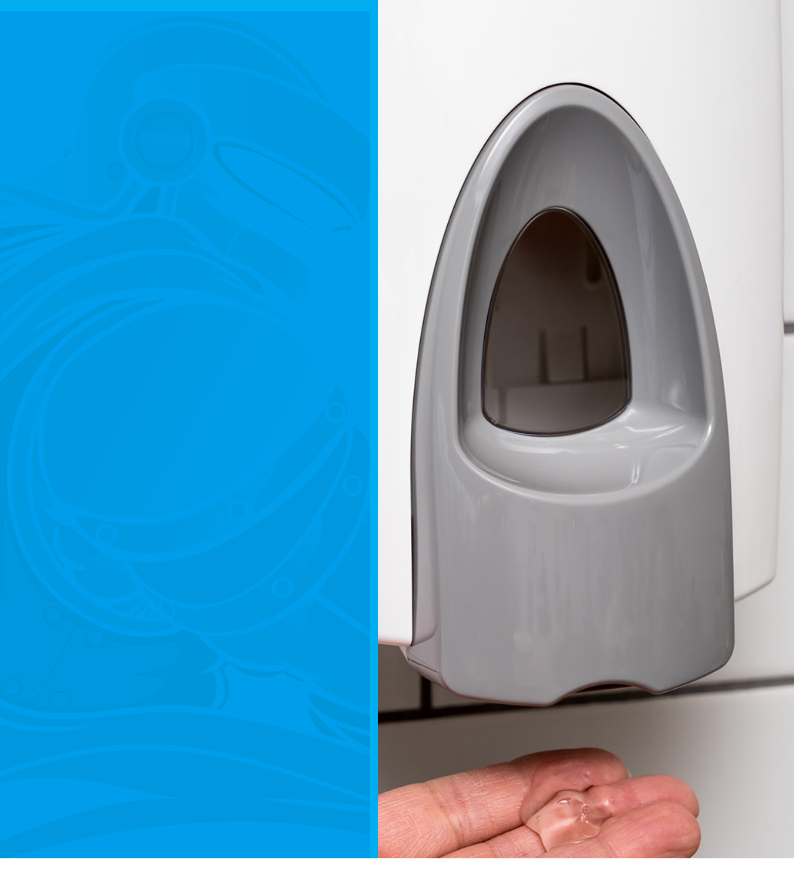
LEGEND Hand Care Dispensers