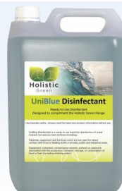
UDF2 - Holistic Green Uniblue Disinfectant