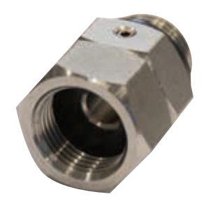
Description Order Code Stainless Steel SKS01368 Swivel Connector

A 1/2" male BSP to 1/2" female BSP stainless steel swivel fitting for connection into any 1/2" female washdown gun.