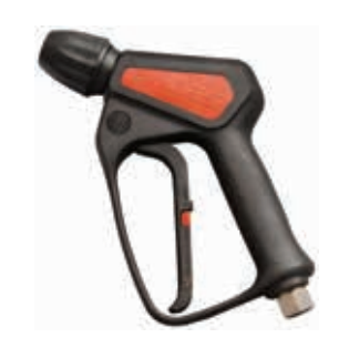
Description ST2600 Easy Pull Trigger High Pressure Gun with Kew Quick Connect & Swivel

Inlet connection 3/8" BSP female swivel. The swivel allows easier handling of the gun and