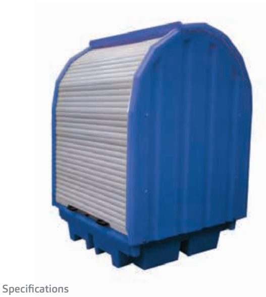
BP4HC Storage Depot Dimensions W1420mm\ x\ L1470mm\ x\ H2070mm\ Sump\ Capacity\ 410\ Litres Holds\ 4\ x\ 200\ litre\ drums\ or\ 20\ x\ 25\ kg\ Kegs