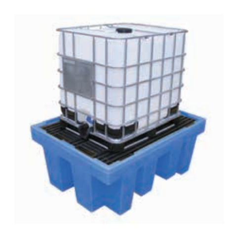
Specification Single Bund Stand Dimensions W1350mm x L1760mm x H710mm

Please be aware that bunds are not designed to have chemical sat in them indefinitely. Spills should be cleaned up immediately.