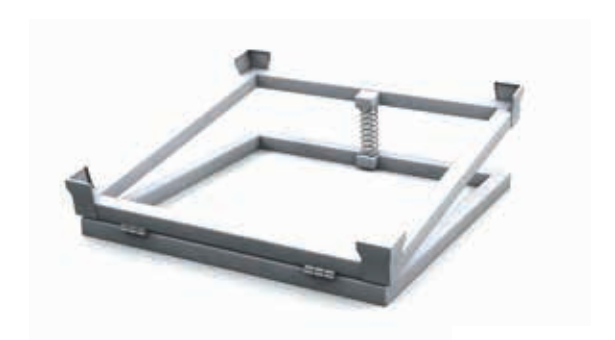
Description Stainless Steel IBC Tippers

Avoid health and safety issues that arise from makeshift tipping solutions such as wooden blocks or misused pallet trucks.