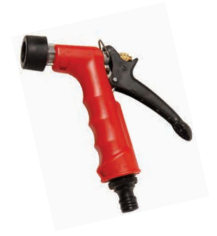
Description Light Duty Water Gun

1/2" BSP female inlet connection Max Pressure : 362 psi (25 bar) Max Temp: 95°C (203°F) Max Flow: 19 litres/min (4.2 gal/min)