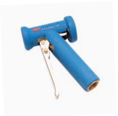
Description Compact Water