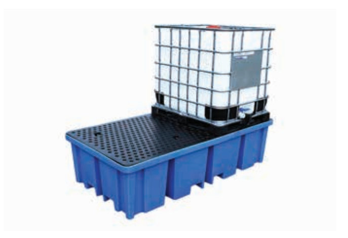
Specification Double Bund Stand Dimensions W1350mm x L2560mm x H510mm Description Order Code Double Bund Stand SKS04009