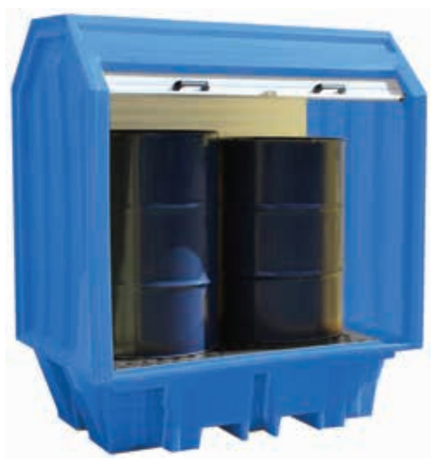
Specifications BP2HC Storage Depot Dimensions W990mm \times L1490mm \times H1690mm Sump Capacity 230 Litres Holds 2 \times 200 litre drums or 10 \times 25 kg kegs