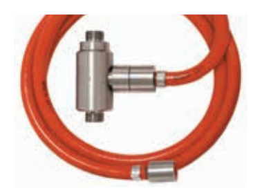
Description High Pressure St/St Injector Red Hose