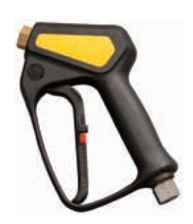
Description ST2300 High Pressure Gun with Swivel