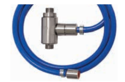
Description High Pressure St/St Injector Blue Hose

A quality stainless steel injector for use on high pressure systems where dilute detergent or foam is required. The chemical strength is controlled by inserting an orifice plate (not supplied) into the chemical inlet side to give accurate control of the chemical strength. 3/8" male BSP inlet/outlet connections.